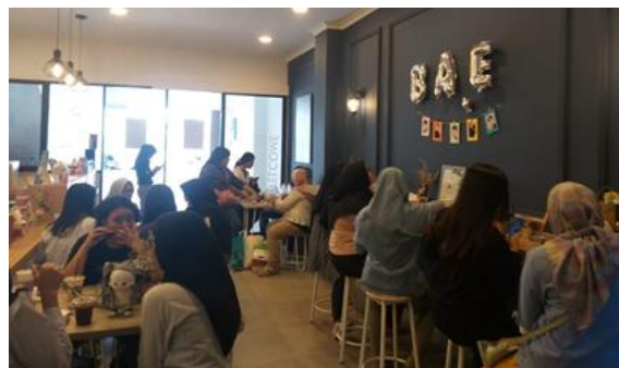
Figure 1. Café events that Wannables (Stars Sparkle Community) held in Indonesia when one of Wanna One's member had a birthday

Based on what the informant said about the event, the café event itself is usually only in South Korea. It is only Korean fans who always hold a café event, but in 2018, the café event culture is begin start in Indonesia.