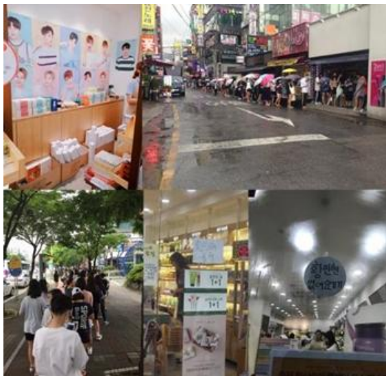
Figure 3. The situation of Innisfree store when they have Wanna One product version

products, namely Innisfree, so that fans want to buy products that Wanna One also advertises. Even though the Wanna One version of Innisfree is not sold directly in Indonesia, many Wannables buy it with the help from people who do open the service to buy Wanna One thing in Korea and then sell them to international fans, so even if the product is not launched in Indonesia, Wannable can still own it.