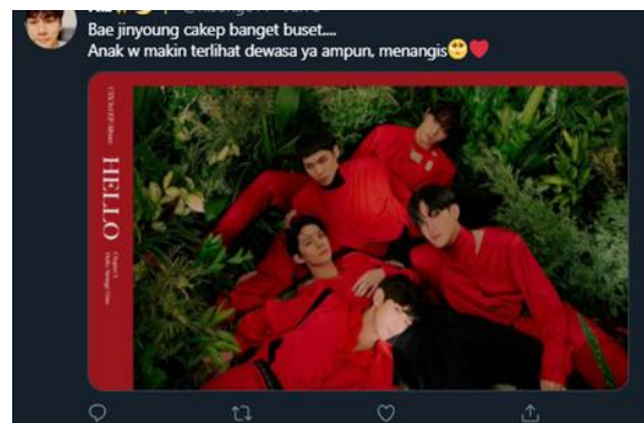
Figure 5. A example of K-Pop fan when their react to K-Pop idols update on Twitter

They often have a high imagination when there is an update from their favorite member so they will respond in various ways. For example, quote some tweet on Twitter that contains an expression of their feelings when they see uploads from K-Pop artists themselves. Things like this can be called parasocial interactions, considering that only fans feel their own pleasure when content is uploaded from these K-Pop idols. They assume that there is intimacy, but it is not. This is due to the increasing intensity of K-Pop fans who tend to want to know everything about K-Pop idols so that they can ignore the boundaries between reality and imagination.