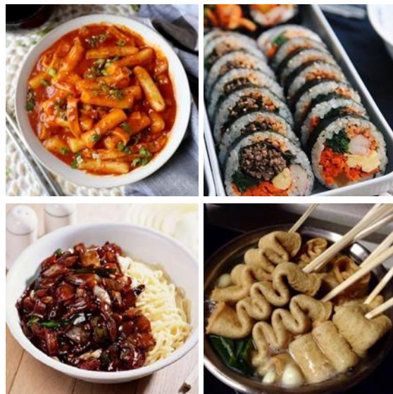
Figure 4. Korean Street Food

are many restaurants and small shops that sell specialties from South Korea.